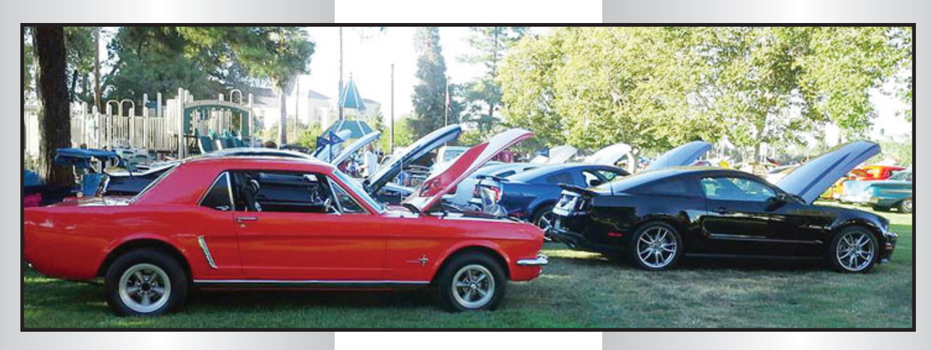
This little gathering is becoming more and more popular. Great times in a small park with plenty of shade. Just hang out and have a blast.