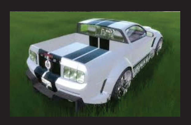
Submitted By: Jim Sanborn